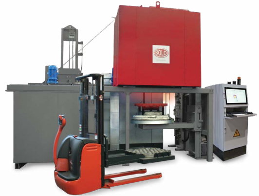
1 semi-automatic furnace and 1 quench tank