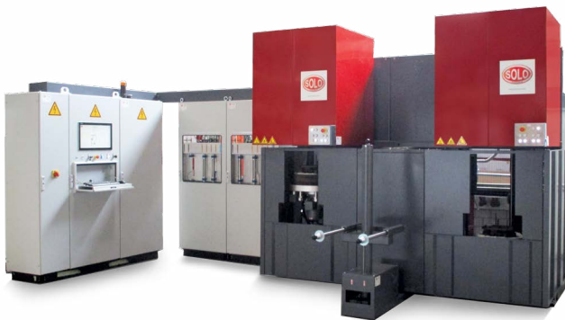
2 semi-automatic furnaces and 1 quench tank