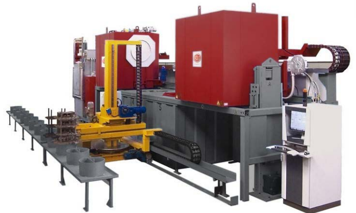
Full automatic line of 3 furnaces and 2 quench tanks