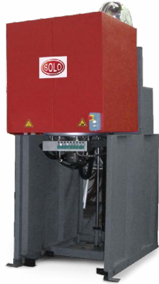
1 manual furnace