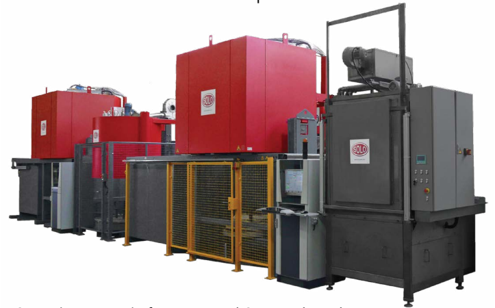
3 semi-automatic furnaces and 2 quench tanks